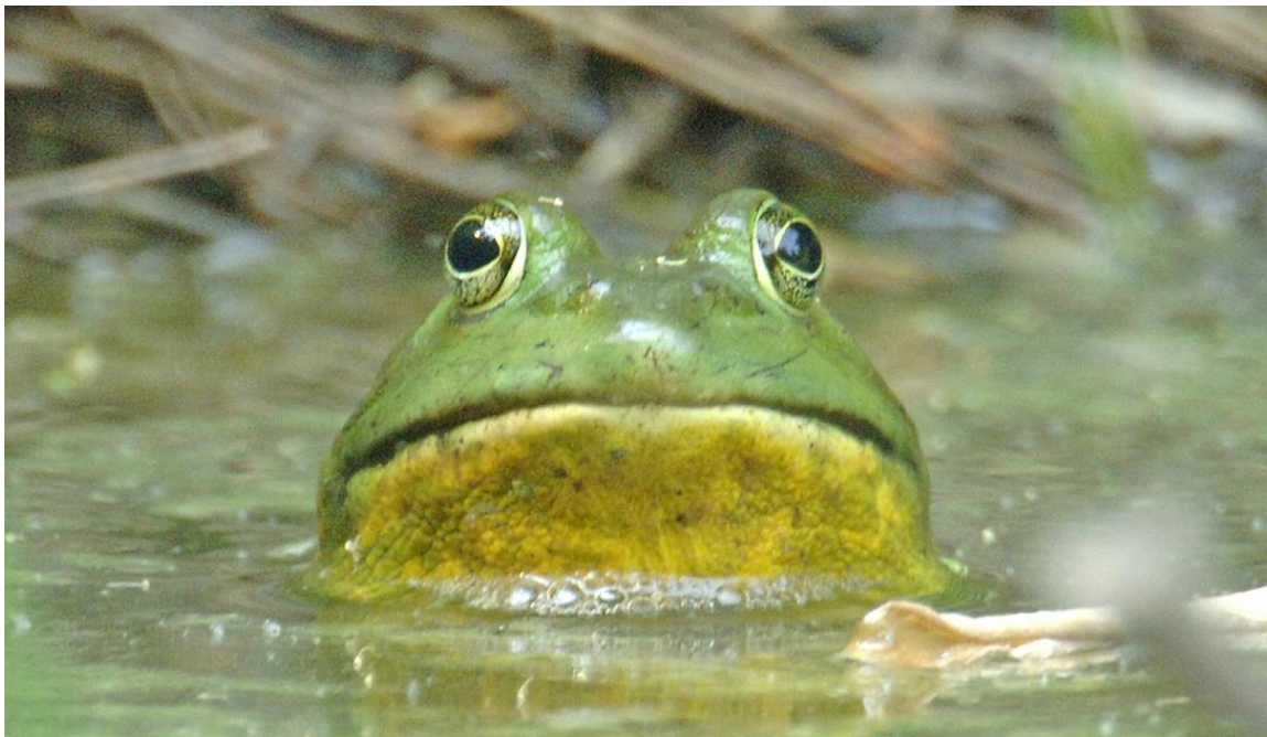
Green Frog by Randy Streufert

Time's running out on your opportunity to submit photos for the Friends' photo contest. We are looking for images that capture the magic of the park. There will be a 1 st prize winner ($200) for youth (ages under 18), a 1 st prize winner ($200) for adults (ages 18 and up), and a grand prize winner ($300).