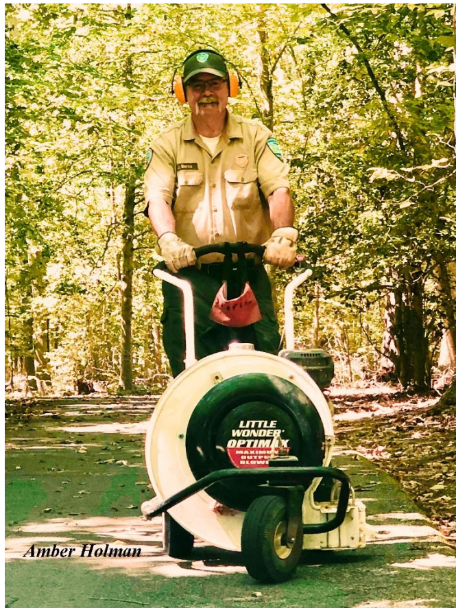
“Rolling Out the Red Carpet”