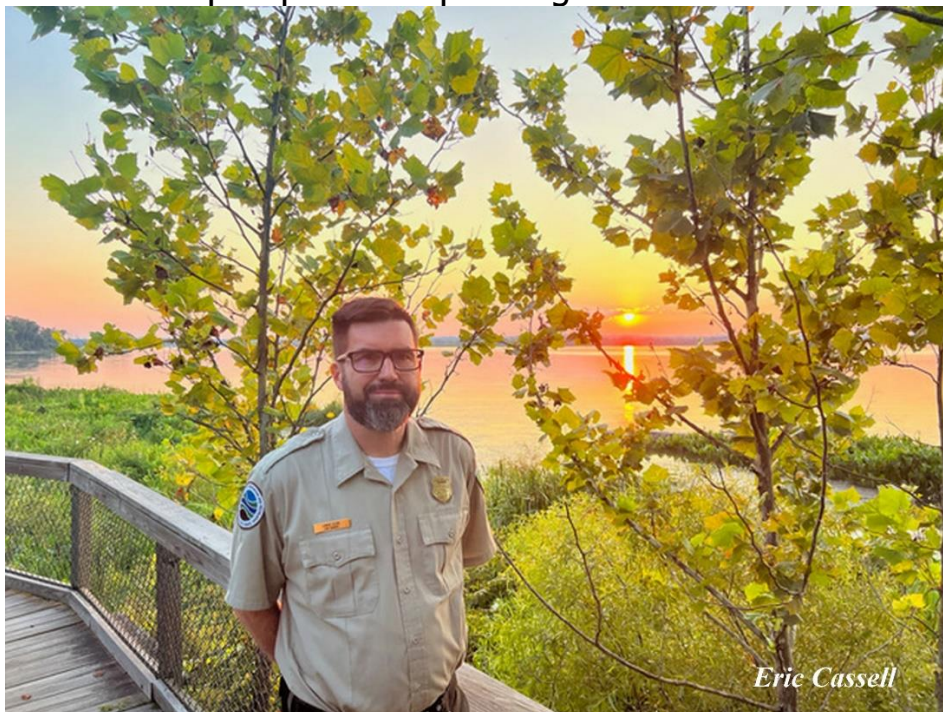
"Patrolling the trails at Sunset"