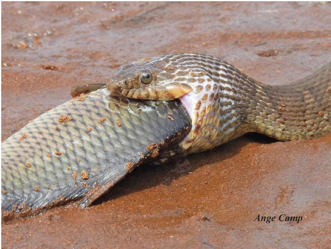
First Place – Adult – Ange Camp – “Mouthful”

Caption: “I could not believe it when I glanced by the water on the beach area of Mason Neck and saw this water snake with his catch. I chose this photo as I believe it shows beauty while also showing the circle of life.” Note: Ange also won First Place in last year’s contest.