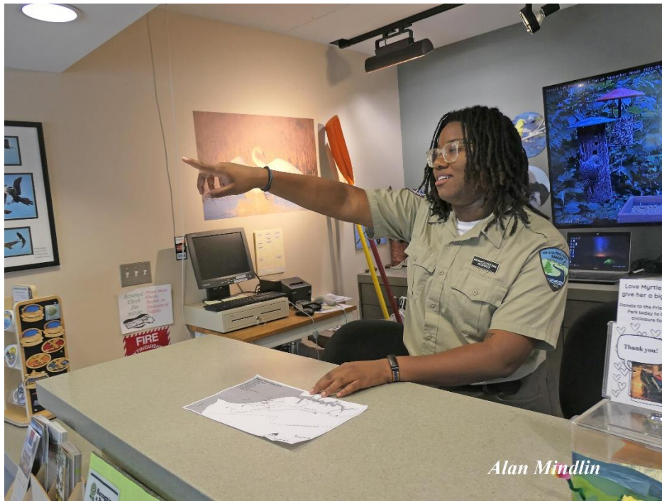
"Helpful park interpreter gives directions"