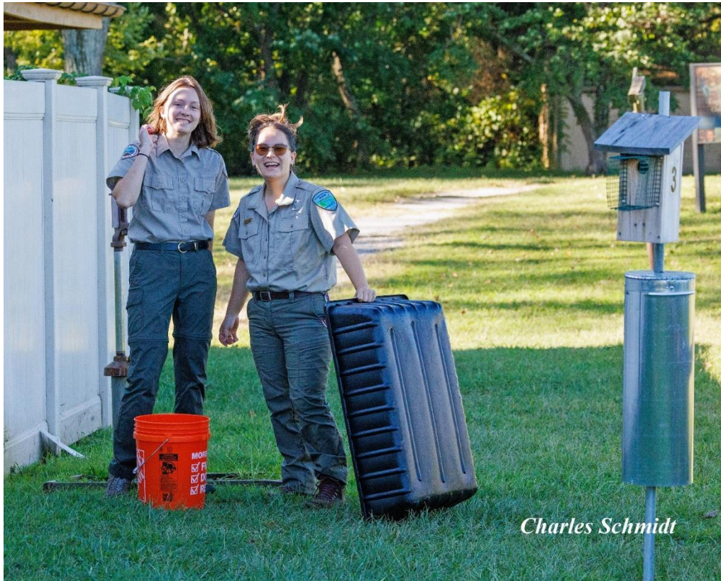
"Staff Members Working at Visitor Center"

Photographers take note: We will be considering some changes for next year's contest, including the contest opening and closing dates, so stay tuned for future notices.