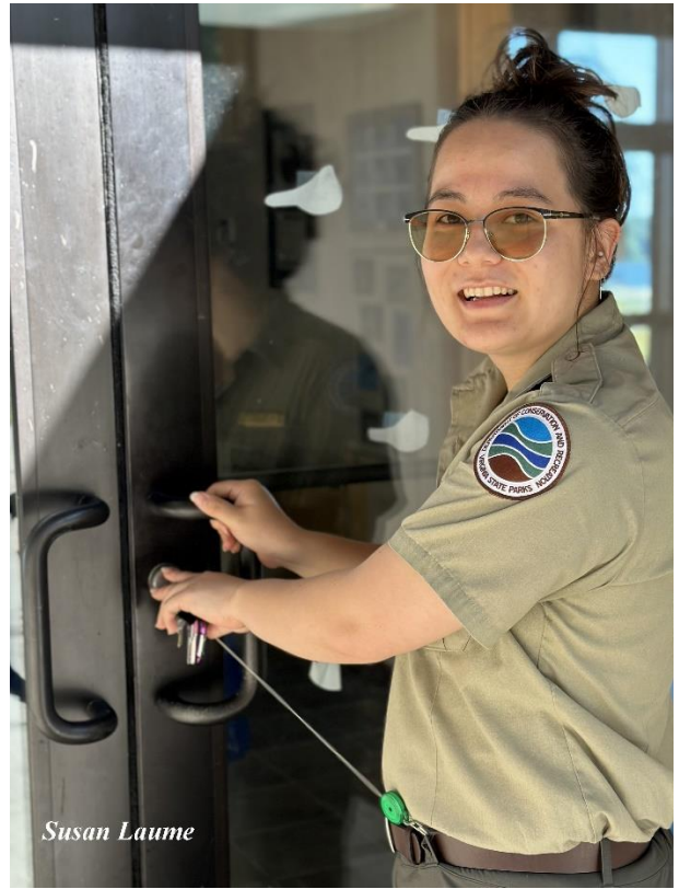
“State Parks Open Doors to Natural Wonders”