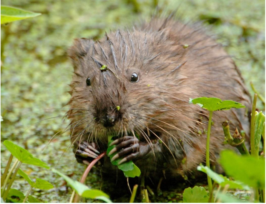
Muskrat feeding on marsh vegetation

Chick O'Dee's reply : Yes Gerald, muskrats also live in the park and are fairly common. They are active year-round, and since they feed at all times of the day, your odds of seeing one are good.